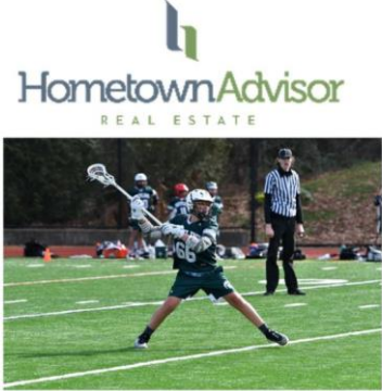
Spartan Level Sponsor